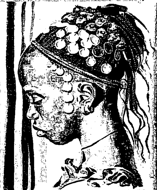
3 Picasso used models for his paintings. Although you expect this African-American subject to be portrayed in warm, earthy colors, the use of a cool palette provides an element of surprise. Cool tones can be used for intense emotions, such as isolation, but also help define expressive faces.