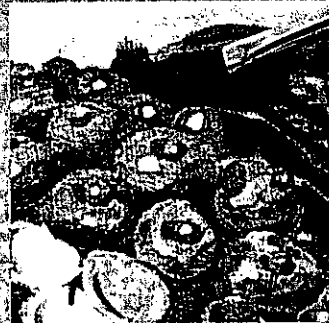
2 Use variations of blues, greens, and violets for the shadow areas and headpiece details.

Research Picasso Blue Period paintings, create a portrait either w/ paint or watercolor paint that is mostly one color just different lights and darks of that one color.