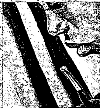
1 Using a limited color palette, blend in two cool complementary colors to get a deep gray tone.

Create a blue painting in the style of Picasso's Blue Period. Select a human subject and use variations of blue and purple to convey the sitter.